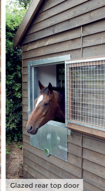
Glazed rear top door