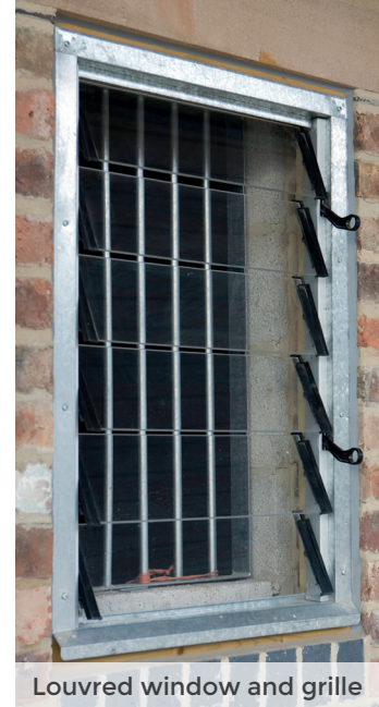
Louvred window and grille

In addition, Scotts designs and manufactures specialised stable windows to fit in with your project. Scotts is able to supply a variety of alternative styles and options, including hopper windows as well as standard casement windows for offices or workshops.