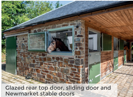
Glazed rear top door, sliding door and Newmarket stable doors