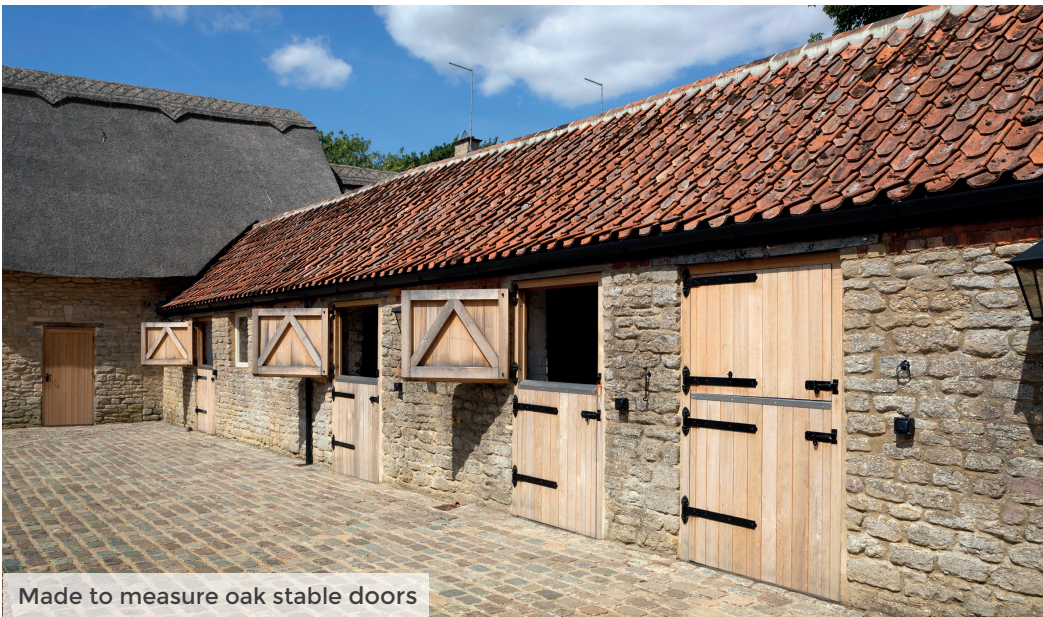
Made to measure oak stable doors

Scotts of Thrapston manufactures and supplies high-quality stable doors and windows. If you are building your stables in brick or block or refurbishing older timber or period stone stables, Scotts has the solution. The extensive range of doors and windows can be purchased off the shelf or specified to your own individual requirements.